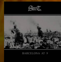
(2024) SMRT - "Barcelona at 9".

In this record we offer a really raw Black Metal but very, very progressive.