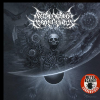
(2020) Metal Against Coronavirus - "Celestial Burial".

A star line up on this Death Thrash Metal single.