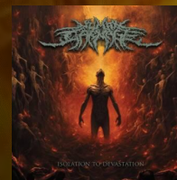
(2025) Human Carnage - "Isolation to Devastation".

Even more technical than "Ancient Covenant of Obscenity".