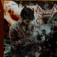
(2012) Aggression - "Vlocracy".

Technical Thrash Metal. For fans of Annihilator, Testament, Coroner, Atheist.