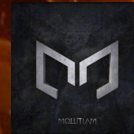
(2019) Mollitiam - "Mollitiam".

Metal Prog with spanish lyrics. All the instrumental musicians are super pro.