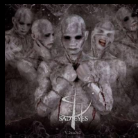
(2025) Sad Eyes - "V 5en5e5".

Brutal Death Metal. Very brutal, fast and technical.