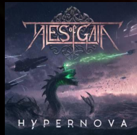
(2017) Tales of Gaia - "Hypernova".

Power Metal. Hyper fast, with very high vocals and technical guitar solos.