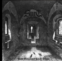
(2020) SMRT - "Sabb Masochistic Ritual Temple".

Experimental Blackened Death Metal. I split the bass lines with Steve Di Giorgio.