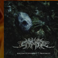
(2020) Human Carnage - "Ancient Covenant of Obscenity".

Technical Brutal Death Metal with some Black taste on the composition.